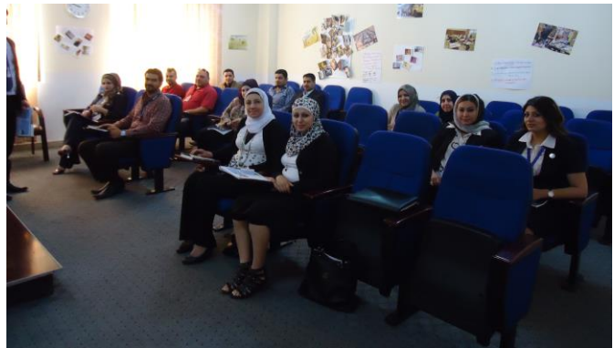
Students from the Commission of Integrity and Offices of Inspectors General attending a course at the Anti-Corruption Academy

The Government of Iraq and Commission of Integrity have remained supportive of this Project throughout the year.